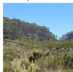
West Ginini

Please provide at least one photograph of the site: