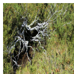
Peat flow (, 11-02-2013)