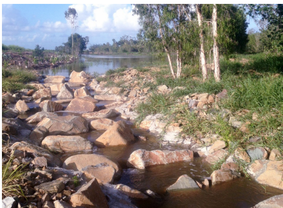
Nature-like rock ramp fishway connecting the wetlands with downstream receiving waters.

The treatment train of wetlands was constructed within a 'cane drain' immediately upstream of a degraded lowland wetland in Mackay, Central QLD. During rainfall events, water high in nutrients, herbicides and pesticides draining 500 hectares of sugar cane would enter the wetland via the drain before flowing into Bakers Creek estuary and through to the Great Barrier Reef. Previously, the wetland was used to irrigate sugar cane, and would often be pumped right down in the heat of summer. Low water levels combined with poor water quality exacerbated wetland impacts, potentially leading to fish kills.