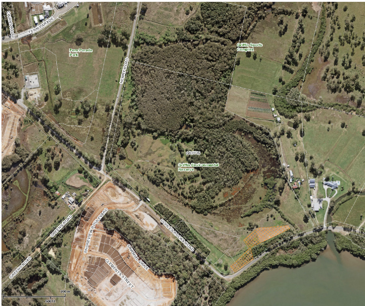
Aerial Map showing staged revegetation at Griffin Environmental Reserve, 2013