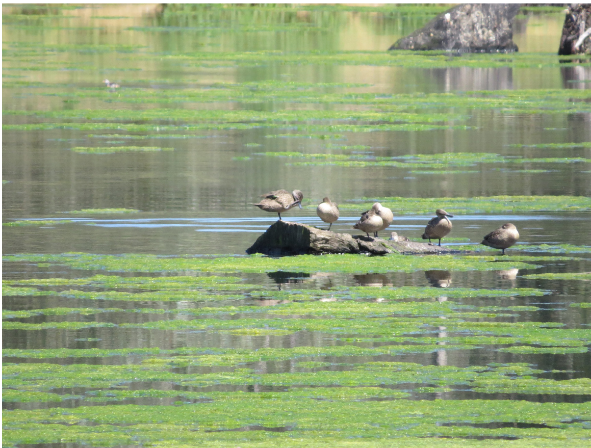
Ducks on emergent timber at wetlands (Tony Phelps)

As the source water into the wetland is from the Council owned treatment facility, Council officers have the ability to manage the water levels within the wetland independently of river levels and rainfall events. This makes the constructed wetland almost drought proof, as the supply of treated water into the wetland ensures that even in extended drought periods the ponds will have a typical wetting and drying cycle. The wetland is now a valuable resource for wetland fauna and flora in a climate of uncertain weather patterns.