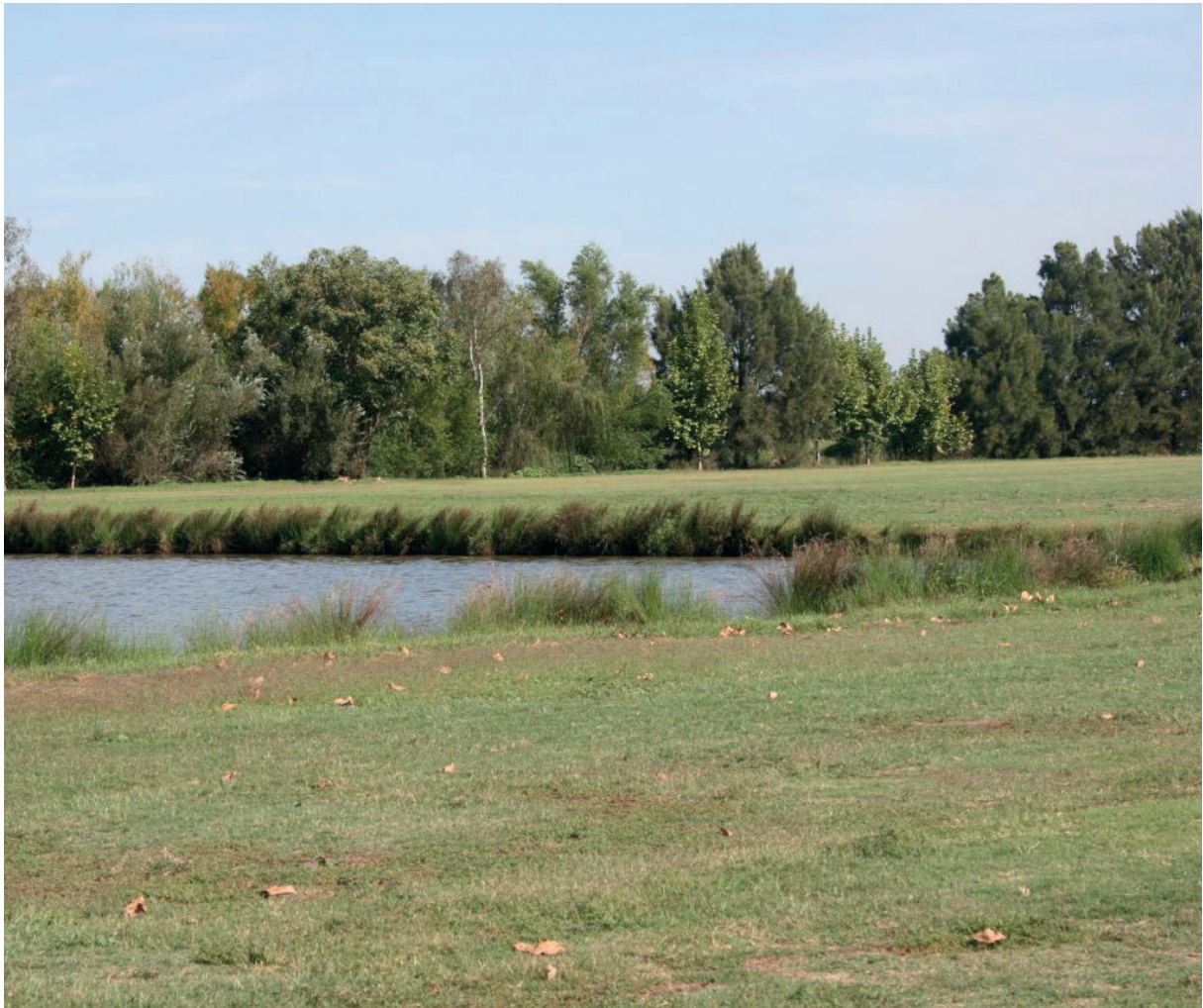
Currently the polo club mows to the water's edge. Green Army Wetland Warriors will revegetate this area to create a riparian buffer.