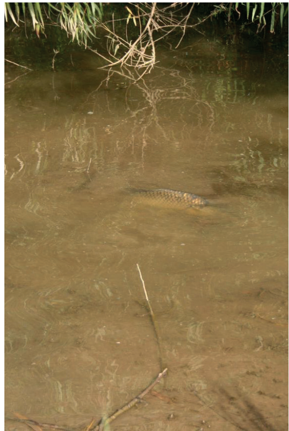
Carp are a huge problem throughout the Hawkesbury wetlands.

Sydney Polo Club, which recently won a bid to host the 2017 World Polo Championship, is one of these stakeholders whose property borders lagoons. The club's mown lawns currently extend to the lagoon rim with no fringing zone of vegetation to protect the banks from slumping and to filter effluent from the nearby horse stables. HEN is currently partnering with the club's land management staff to establish appropriate buffer zones to protect the lagoon. The club is also planning some positive community engagement activities in the lead up to their high profile events. These include University and TAFE ecosystems field classes and carp fishing classes for pest management.