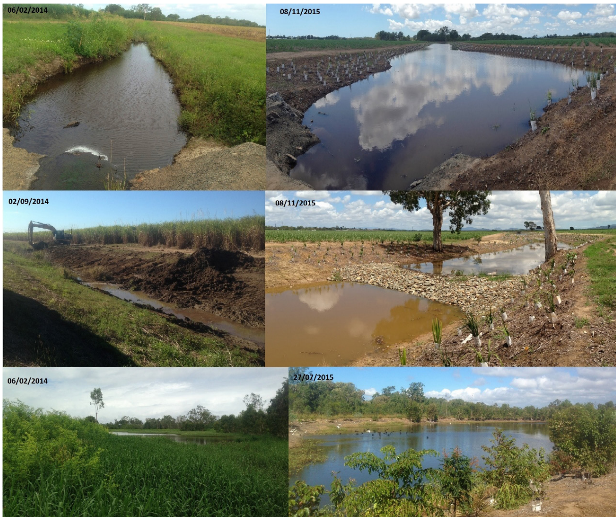
From top: Pre and post wetland construction works. (Matt Moore)

catchmentsolutions.com.au/this-train-is-a-treat/