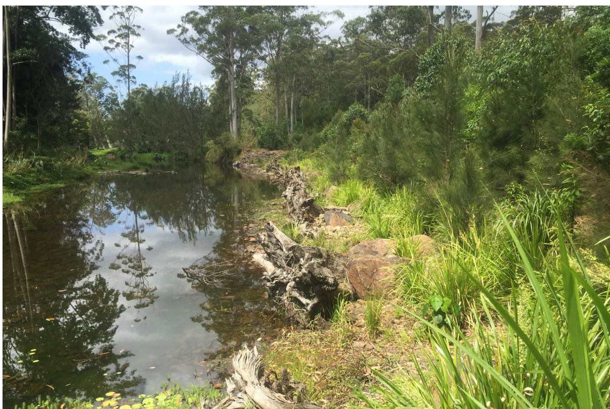
Looking downstream at the completed large wood riverbank stabilisation and revegetation works at Smales Park.