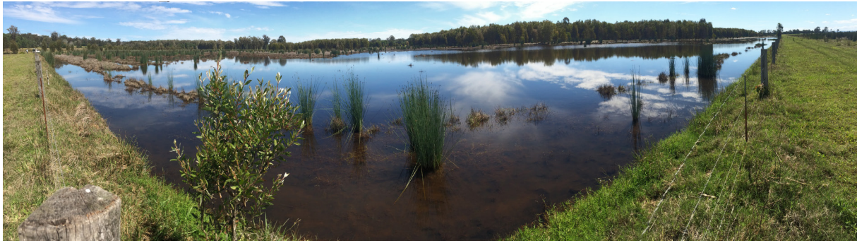
Water now covers a previously scalded area

After several years, the property owner recognised that tea tree production at the lowest elevations would always be compromised by the area's tendency to become inundated when wet and scalded when dry. The project concept was re-visited in 2015–16, this time by NSW Department of Primary Industries (Fisheries) with our project partners WetlandCare Australia (now Conservation Volunteers Australia) and North Coast Local Land Services. Discussions highlighted that raising water levels in the lowest parts of the wetland would simultaneously raise groundwater in the slightly higher tea tree paddocks and increase their productivity.