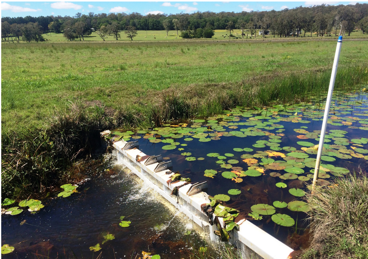
Newly installed weir with wetland flows discharging downstream

In the early 2000s NSW Agriculture were approached for some technical advice. They established a monitoring program to examine the nature and scale of the problem, while identifying potential solutions. pH levels of 3 to 4 were commonplace (classed as extremely acidic). The research recommended raising the water table, however this reduced the ability to grow tea tree in the lowest parts of the wetland and the trial was abandoned.