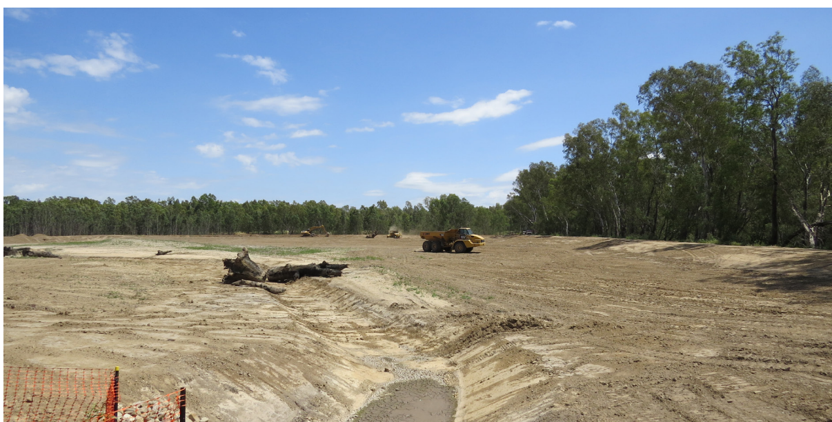
Construction works reshaping ponds and installing woody debris

Water is supplied to the Marrambidya Wetland as treated effluent from the adjacent sewerage treatment facility. Its quality more than meets the threshold parameters required by the Environment Protection Authority. The 22,000 riparian and aquatic plants that have been planted in the wetland provide an additional bio-remediation process to the treated water.