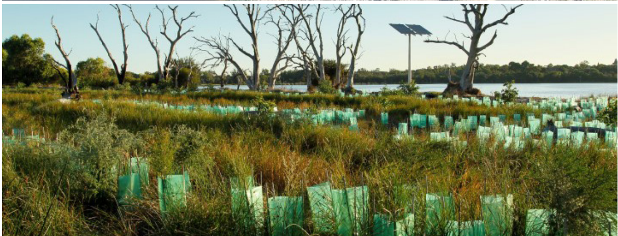
Top: Aerial Photo, 23 Jan 2016