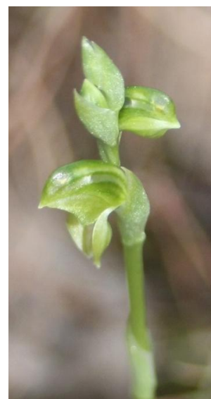
The ecological community provides habitat for the endangered orchid Pterostylis gibbosa (Illawarra greenhood)

Human settlements and infrastructure where an ecological community formerly occurred do not form part of the natural environment and are therefore not part of the ecological community — for example, sites where an ecological community has been cleared and replaced by developments. This also applies to sites where the ecological community exists in a highly-degraded or unnatural state. For instance, cropping lands and exotic pastures, or areas where much of the native vegetation has been replaced by exotic species, are no longer part of a natural ecological community.