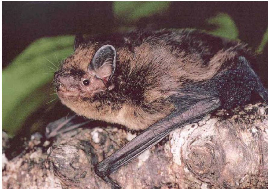
Image: Pipistrellus murrayi (Christmas Island Pipistrelle, Lindy Lumsden 2007)

You are invited to provide your views and supporting reasons related to the eligibility of Pipistrellus murrayi (Christmas Island Pipistrelle) for inclusion on the EPBC Act threatened species list in the Extinct category.