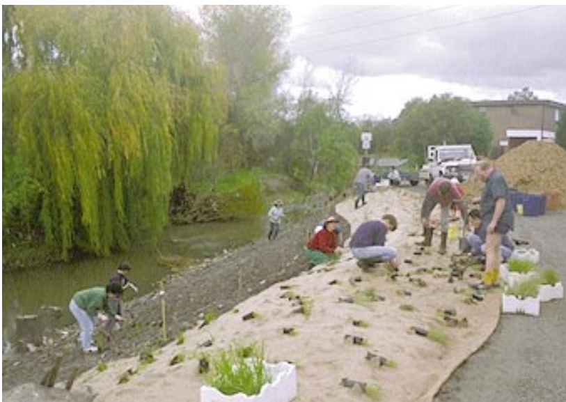
There is growing community concern about the environment. 'Friends of Merri Creek' replant the banks of the creek with native grasses.

State of the environment reporting is one of the most powerful tools for informing the public about their environment. It describes the effects of human activities on the condition of the environment, as well as the implications of this for human health and economic well-being. It also provides an opportunity to monitor actively, directly and accountably the performance of government policies against actual environmental outcomes, which makes it, effectively, a 'report card' on the condition of our environment and natural resources. This allows discussions about future economic and social development, and consequent policy, to be based on accurate and commonly agreed perceptions of environmental conditions and trends. If these conditions and trends are identified as they develop, decision-makers in industry and government would be in a position to avoid policies that might be environmentally unsustainable. Such policies could otherwise be socially and economically inequitable and costly.