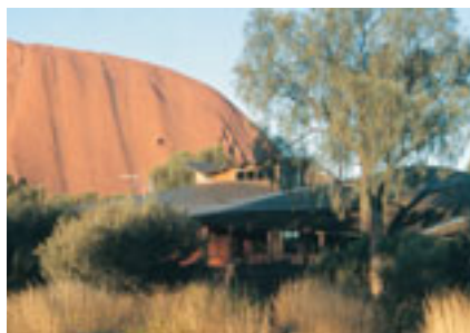
Left to right - the Cultural Centre and the Cultural Centre logo

Kanyangatja mulapa wali nganampa - Anangu marutju takum, Anangu uwankaraku - Pitjantjatjara This building truly represents us Anangu people, it is for all people to visit.