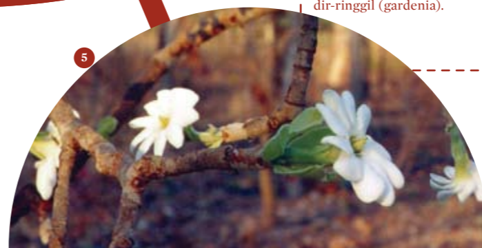
5 Munggyu eat the fruit of dir-ringgil (gardenia).

Follow the creek downstream through more falls to the South Alligator River. Estuarine (saltwater) crocodiles live in the river so do not swim there. Return to the carpark by following Motor Car Creek to the old bridge and vehicle track.